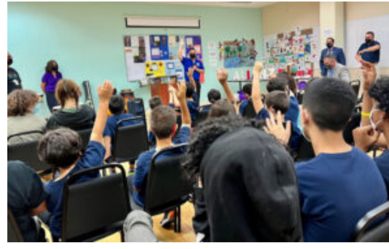
Congressman Darren Soto participated as a guest speaker in the Youth Motivational Guest Speakers Series at Alianza Center's leadership summer program.

Alianza Center's Summer, Cameras, Action! Summer Program , a free leadership camp focused on strengthening heritage connections, cultivating a healthy sense of self, and engaging cultural education for Central Florida youth, is now enrolling for the July 11th through July 22nd session. The deadline to apply is Thursday, July 7th.