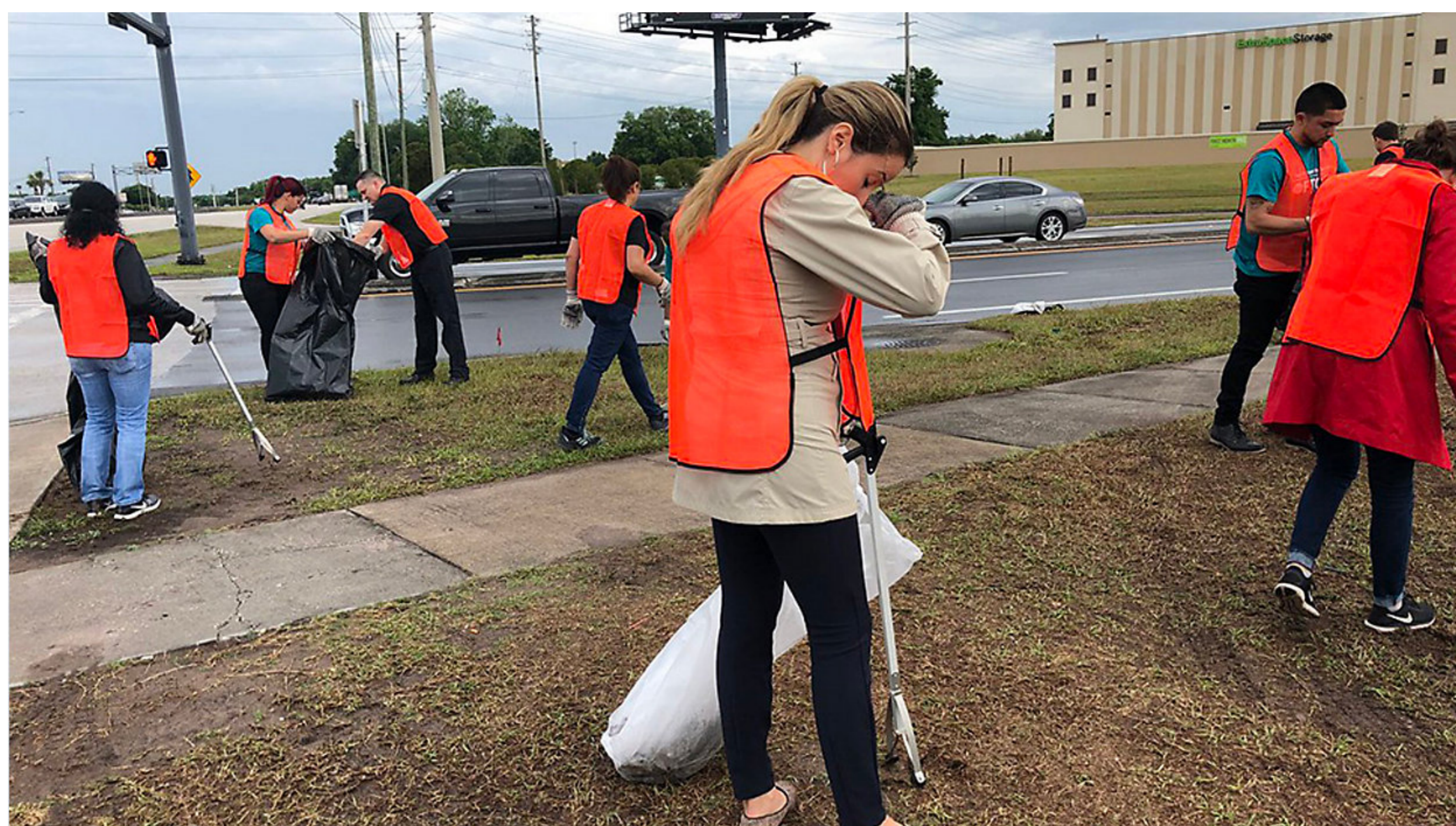
More than 50 volunteers picked up trash along U.S. 192 in Kissimmee on Friday for National Volunteer Month.